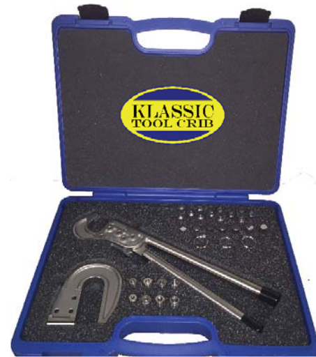
Includes custom foam molded carrying case.