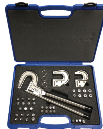
Includes custom foam molded carrying case.

This 45 piece kit comes with semi-tubular, oval, AN470, AN455, AN430, AN442 & dimple die sets (male and female) for sizes 3/32, 1/8, 5/32 & 3/16. Also has assorted flush sets. All Sets are .187 shank. Custom Foam molded box with 1 1/2" hand rivet Squeezer and 2" & 3" yokes and quick release pins. The Hand Squeezer has adjustable set holder to easily adapt to multiple riveting applications. Tool is made of Stainless steel and quality craftsmanship.