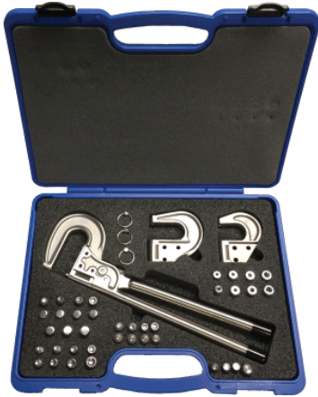
Includes custom foam molded carrying case.

This 45 piece kit comes with semi-tubular, oval, AN470, AN455, AN430, AN442 & dimple die sets (male and female) for sizes 3/32, 1/8, 5/32 & 3/16. Also has assorted flush sets. All Sets are .187 shank. Custom Foam molded box with 1 1/2" hand rivet Squeezer and 2" & 3" yokes and quick release pins. The Hand Squeezer has adjustable set holder to easily adapt to multiple riveting applications. Tool is made of Stainless steel and quality craftsmanship.